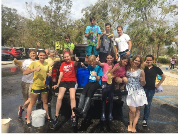
Raising funds 2017