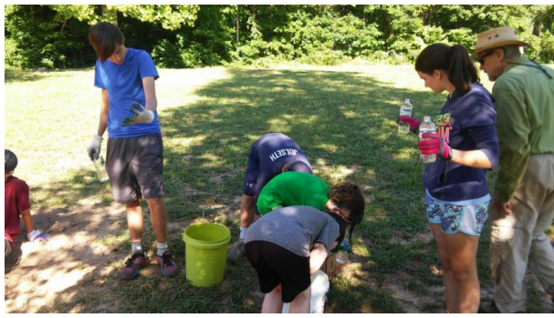
Working a garden plot during 2016 mission trip